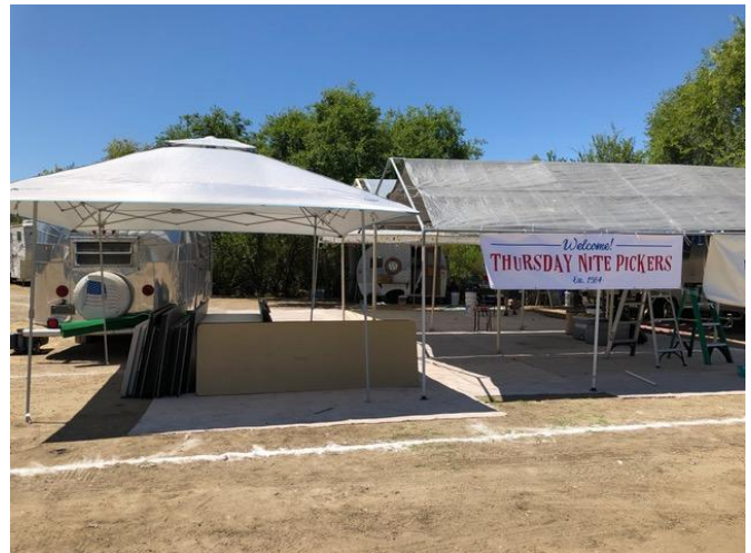
Thursday Night Pickers Compound all set up.